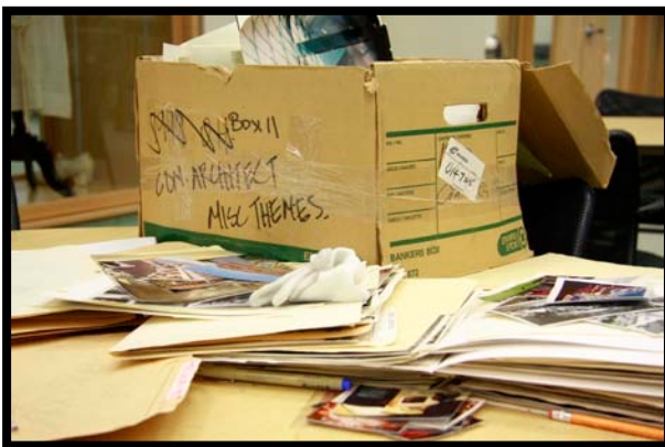
Image 1: Canadian Architect material as it arrived at Special Collections, March 2009

The ways in which an archive is arranged determines the longevity of a collection. The organization of the Canadian Architect image archive remains outside of the scope of this project. This information, however, is provided as a background history in order to provide a further understanding of the purposes of the subject index. The Canadian Architect material underwent a series of organizational arrangements and was completed in advance of this thesis project.