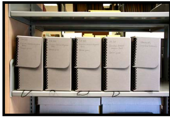
Images 2, 3: Canadian Architect material after cataloguing and organization, March 2010

After the initial group categorization, photographs were separated by project name, placed into an 8 x 10 Archivalware sleeve, acid-free file folder, and given a unique item level description number ( Images 2, 3 ), for example: Chapel Glen (2009.002.070), Quebec box . Initial cataloguing was input into Excel spreadsheets for every group of photograph files, noting the file name, item and object level description, and box in which it was placed. The first boxes to receive cataloguing treatment were the ‘Quebec’ group, as it was determined that they would be the first to be digitized and housed in