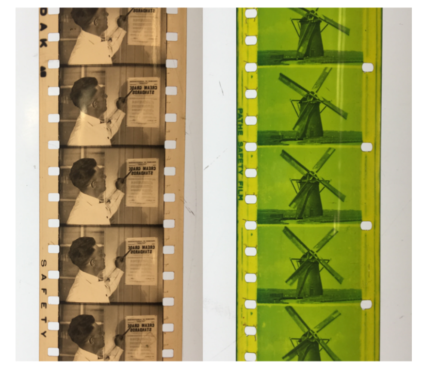
Figure 4. Side by side of [Dairy Farming Industry in Saskatchewan] (left) on Kodak stock and [Wooden Shoes] on Pathé stock. Note the difference in both perforation shape and pattern.

in Saskatchewan, which LAC assigned a year range of 1920-1929, actually dates the stock to 1924 (Fig. 3). The edge code of the second film, [Dairy Farming Industry in Saskatchewan] which LAC also dates 1920-1929, dates the stock to 1925. Although the edge codes do not guarantee that either of these films were produced in 1924 or 1925, they do begin to narrow down the range of production. Given how popular the 28mm format was, it is safe to say that these films would have been printed 1925 or fairly close to that date. Curiously, previous research understood Pathé to be the only manufacture of 28mm film globally. Film historian and archivist Paolo Cherchi Usai points out that Pathéscope films printed in the United States after 1917 had three perforations on each side but does not mention that it was Kodak that was supplying the 28mm stock.3<sup>101</sup>