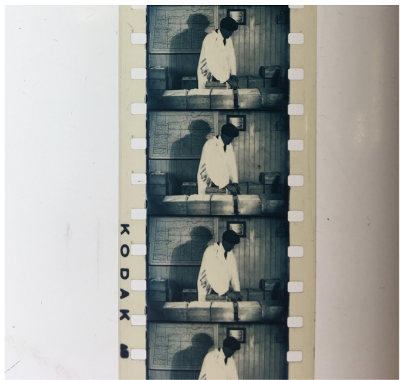
Figure 3. Cream Grading in Saskatchewan printed on Eastman Kodak 28mm stock with edge code symbols displaying a year of 1924.

whom were prize winners." While films like Indian Pow-Wow and The Romance of Huronia were created to appeal to a romanticized colonial image of First Nations' culture, With the Plowmen at Brampton serves inadvertently to present the First Nations people in an un-romantic, un-exotic reality. Less culturally significant but still historically important and rare are two films printed on Kodak 28mm stock rather than the more common 16mm stock, Cream Grading in Saskatchewan and [Dairy Farming Industry in Saskatchewan] . The 28mm stock has edge codes that read, "EASTMAN SAFETY," followed by two symbols that relate to the year of production.