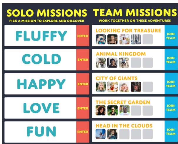
Figure 2: Glopal Photo Missions analyze and think clearly about what each word means to them, allowing for an authentic and meaningful post.

The Glopal app has very distinct features that fulfill the goals I am trying to accomplish through the usage of this app. Those goals being, to help children develop self-awareness, empathy, and a global citizenship within the digital space. The first feature are the photo missions. Photo missions are photo categories for kids to post in. So instead of having a feed they can post freely on, kids will be required to post in any of the photo missions listed on the