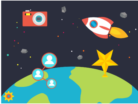
Figure 4: Glopal Homepage

meaning and identity, to develop skills and to learn” (Birch & Parnell, et al., 2017, p. 250). The storyline that I created for them, when they first use Glopal, is that each user is a space explorer on a mission to learn more about planet Earth. We can use “multimedia rich digital stories to be powerful learning tools for instruction across...subjects” (Campbell, 2012, p.