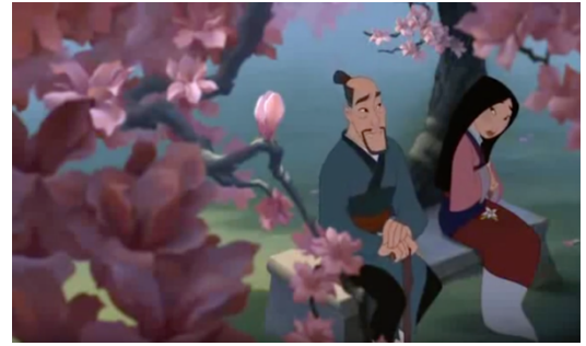
Figure 1: Mulan Under Cherry Blossom Tree Retrieved on August 12 from Mulan (1998). Screenshot by author.

Disney has been known for creating films that work towards the Western Gaze, which create “the orient as exotic, mystical and at times barbaric” (Maddox, 2017). This can be seen specifically in films like Aladdin (1992) and Mulan (1998). In Mulan , Disney clearly failed to accurately depict Mulan’s Chinese culture. The movie is based in China, yet