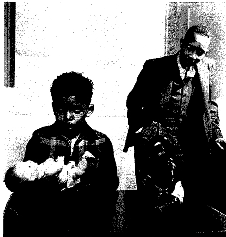
Figure 2. Classic image representing the 'Doll Test' study.

"The Doll Test?" I said under my breath as the student at the front of the class began her presentation. The class was a part of a theoretical foundations course that I was taking in graduate school. I was enrolled in a new masters program in early childhood studies at the same university had previously graduated from the summer before. "Why haven't I heard of this?" I asked myself, saying the words loud enough so that my classmates on either side of me could hear what I said. The image on the screen at the front of the class burned my eyes (Figure 2) 1 . It was all I could see. Why hadn't I seen this image before? I asked myself.