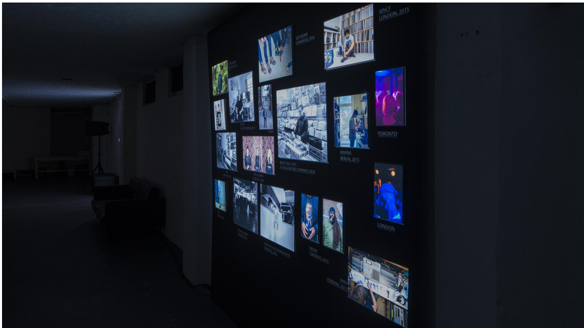
Photo wall at Rally, opening exhibition of Sonic City, 2016

(INUIM) collective in Toronto and have now been offered to exhibit alongside their Power Plant 2016 takeover which will involve three day and night events during July and August where my project will be integrated as an installation. This is a great opportunity not only for me as an artist but more so a new form of bringing documentaries to the public's attention. By interweaving Sonic City into large scale music events with international acts, the “glocality” of the subject matter can really start to be exercised. Just as during the opening exhibition for DocNow, where local artists alongside visiting ones had the opportunity to exchange experiences and showcase themselves through the exhibition, the photo wall acted as the “Torontology” (as some have called it) or local artists along with the juxtaposition of UK’s leading figures created a truly “homie” reflection, a key trait at the core of these music cultures.