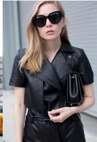
Figure 3. Karla's Closet, Camila Coelho, & Fashion Squad