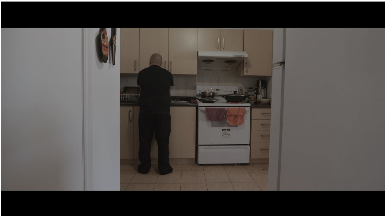
Figure 1.2 (First half of the film) Screen grab of Dento in his kitchen cooking.