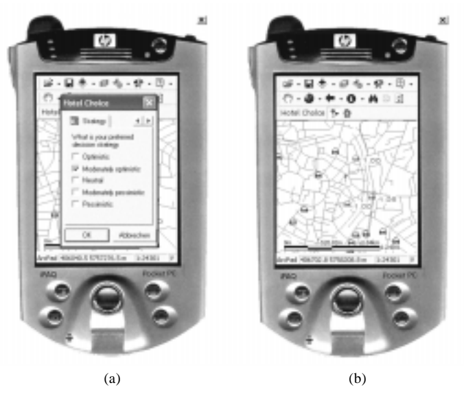
Figure 3. ArcPad desktop emulation showing the selection of a decision strategy (a), and the result of the OWA evaluation method (business traveller profile, moderately optimistic decision strategy) (b)

Clicking the "OK" button for the custom form triggers a subroutine, which reads all user input from the form and performs the OWA evaluation method. The resulting final scores are stored as a new field in the hotel feature attribute table. This field is used for labelling the hotel markers on the map so that the user can find the best-ranked hotel. In the final map only those hotels within the buffer zone, whose scores fall within the top three overall scores are labelled (see Figure 3(b)).