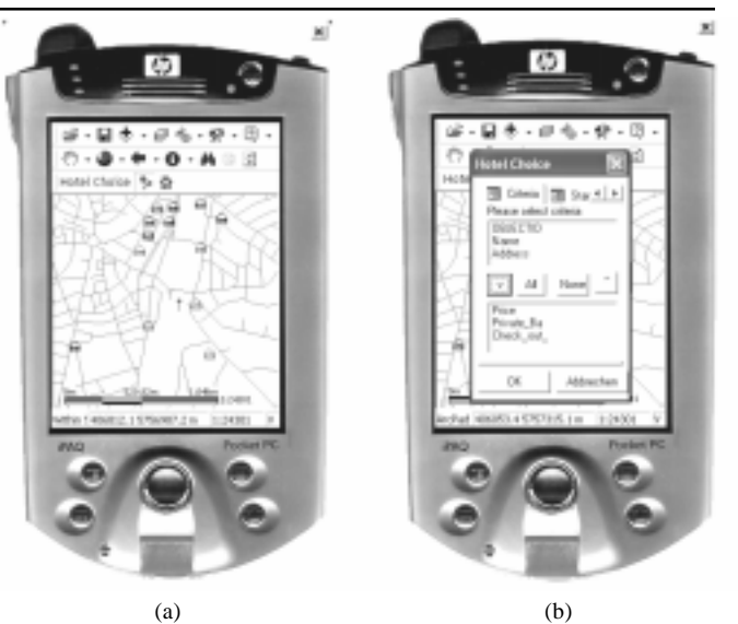
Figure 1. ArcPad desktop emulation showing the filtering and marking of nearby hotels (a) and the selection of criteria by the user (b)

Clicking on the hotel choice tool opens the custom form for