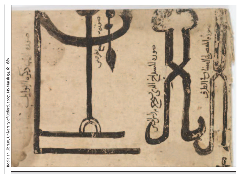
Fig. 1: Vaginal speculum (left), 2 types of forceps and double-edged scalpel (suspended). From a 1271 Arabic copy of al-Zahrawi's Surgery , written in the 10th century.

Ibn al-Nafis, a 13th-century Syrian physician, re-addressed the question of blood movement in the human body. The authoritative explanation had been given by the Greek physicians more than 1000 years earlier. But what had caused them a major problem was how the blood flowed from the right ventricle of the heart to the left, prior to being pumped out into the body. According to Galen (2nd century), blood reached the left ventricle through invisible passages in the septum. Referring to evidence derived from dissection, Ibn al-Nafis described the firm, impenetrable nature of the ventricular septum and made it clear that there were no passages in it. Instead, he concluded, the