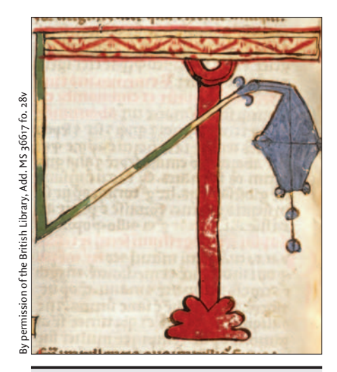
Fig. 2: Vaginal speculum. From a 14th-century Latin copy of al-Zahrawi's Surgery.

upside down, with the blades being mistakenly depicted as a decorative bar. The 6-lobed shape at the foot of the illustration, which ought to be the screw, clearly had no mechanical function. The lantern-shaped device suspended at the right misrepresents the scalpel, which has now been integrated into the speculum.<sup>7,8</sup> Such distortions show that, in the 14th century, the Western world had much to learn from the physicians of the Islamic world.